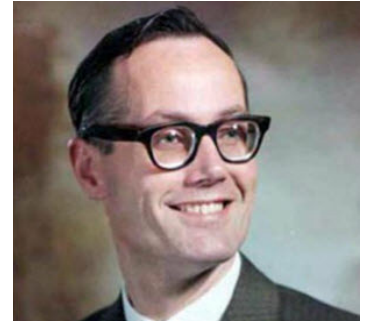
Attorney General Slade Gorton